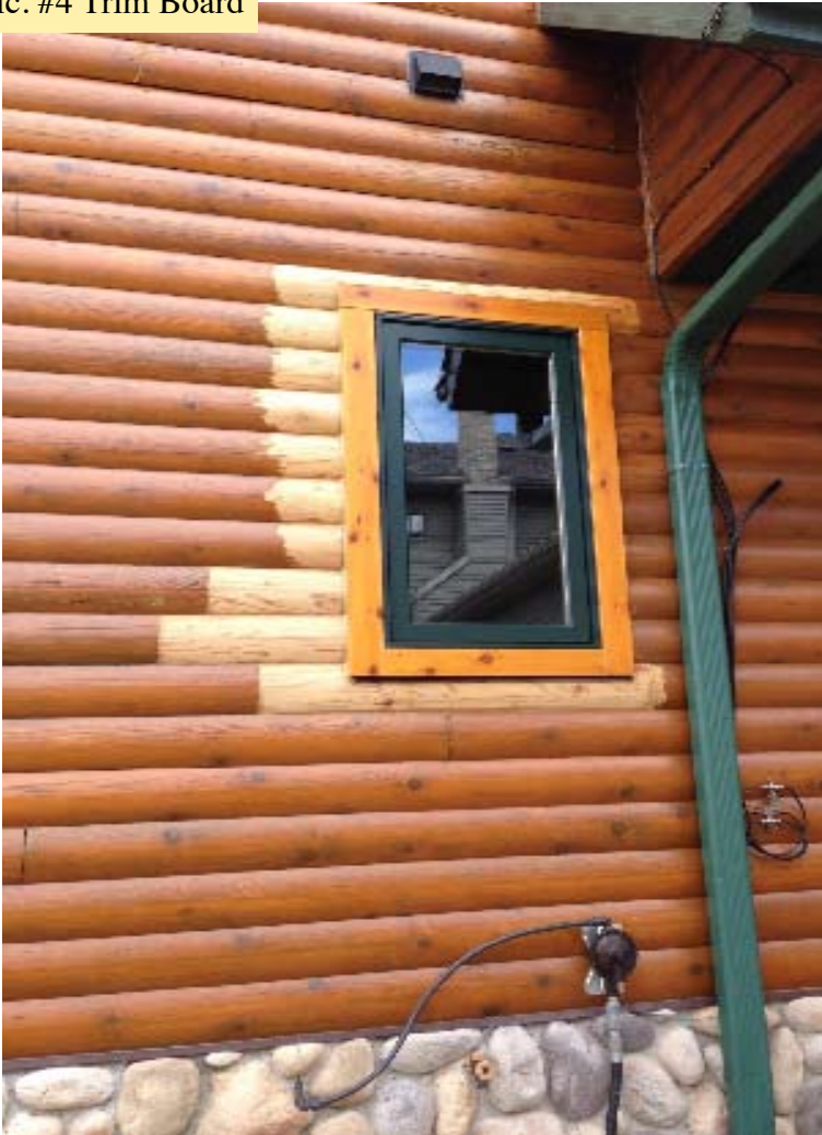
Pic. #4 Trim Board