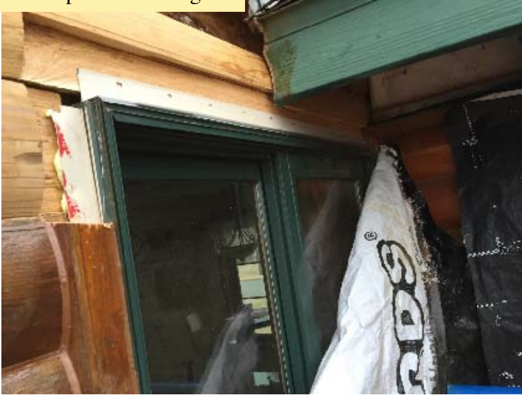
Pic. #1 Separator Nailing Fin